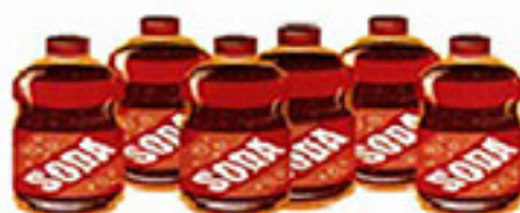
6. bottles of soda