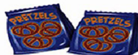
4. bags of pretzels