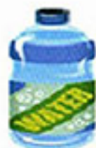
5. a bottle of water