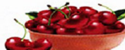
7. a lot of cherries