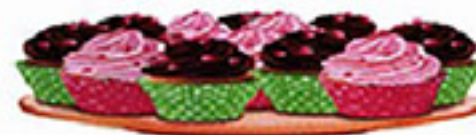
3. a lot of cupcakes