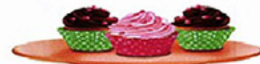
4. a few cupcakes