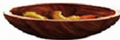
2. a few nuts