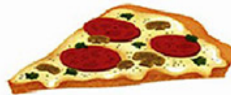
7. a piece of pizza