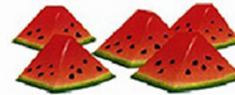
8. pieces of watermelon