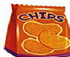
3. a bag of potato chips