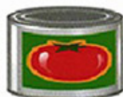
1. a can of tomatoes