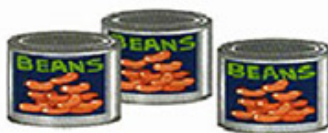
2. cans of beans