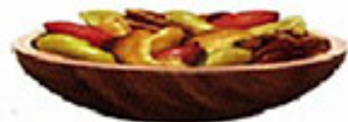
1. a lot of nuts