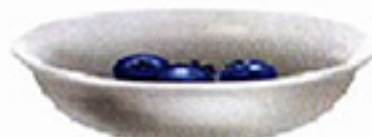
6. a few blueberries