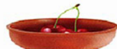
8. a few cherries