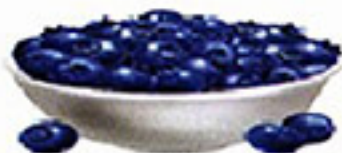
5. a lot of blueberries