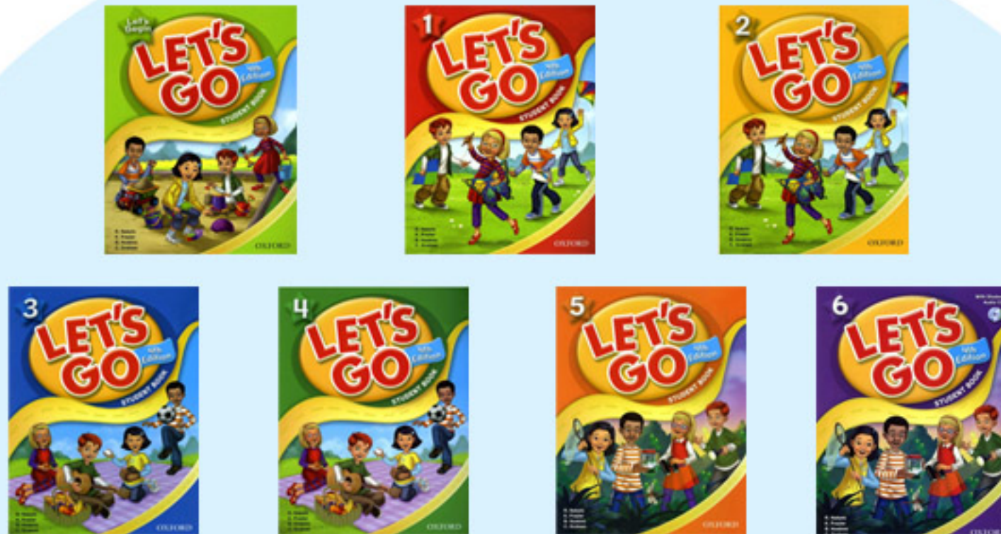
Let's go series