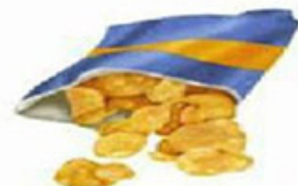
5. potato chips